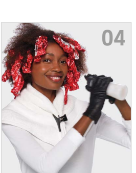
Wrap in a foil to separate.