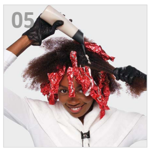
Application Apply on the remaining sections from roots to ends.

Shake for at least 30 seconds to ensure it is fully mixed and ready to apply.