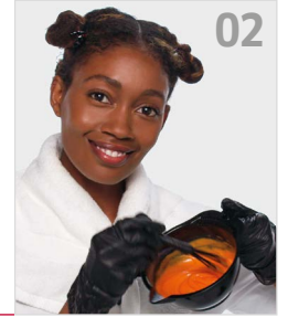
Application Apply on the highlighted sections from roots to ends.

Wella colorcharm 10 vol. Cream Developer