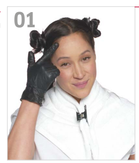
1 > Section Section into 4 parts.