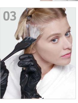
Continue up the side of the head until you reach the center parting. Switch to the opposite side of the head and continue using the same pattern.