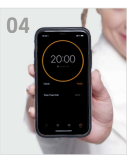
Process 10-20 minutes with no added heat.

Start at the lower front section. Apply color from the roots through the ends.